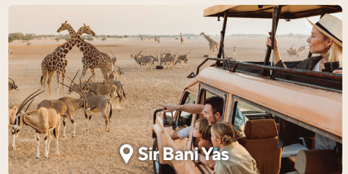
Sir Bani Yas